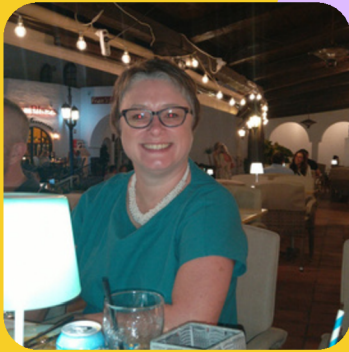
Kerry Committee Member